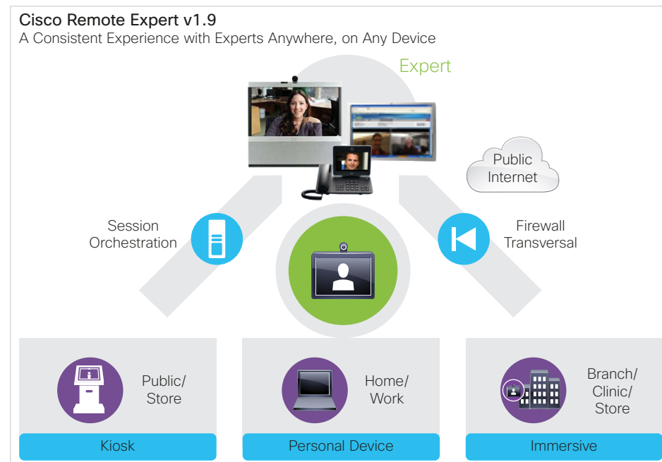
Figure 1. A Consistent Experience with Experts Anywhere, on Any Device

The Cisco® Remote Expert Solution provides an integrated collaboration platform that helps enable profitability by intelligently connecting customers and employees with experts across multiple channels (Figure 1). It also delivers a consistent, interactive experience that helps optimize revenue, improve expert productivity, and build customer loyalty. Cisco Remote Expert creates a virtual pool of specialists, manages their availability, and quickly connects customers with experts across multiple channels and devices, using high-quality audio and video.