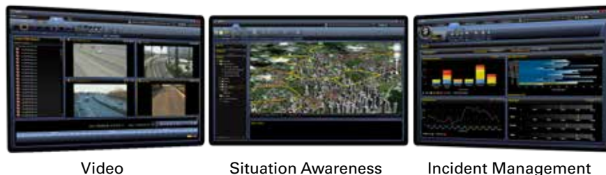
Figure 1 AGT's CityMIND Integrates Innovative Traffic Incident Management Solution Command and Control Tools