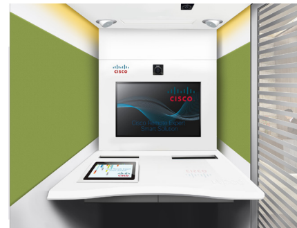
Figure 1. Cisco Remote Expert for Government Services: Citizen and Expert Experience

The view from the perspective of the citizen and the government agent, along with key functional elements, is shown in Figure 1.