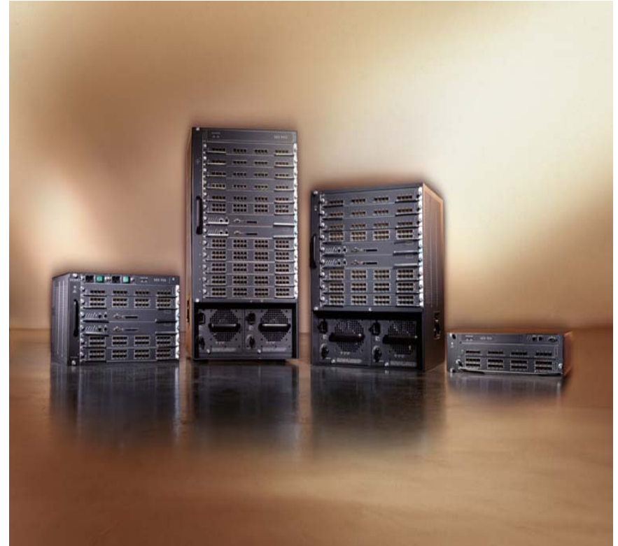
Cisco MDS Family: 9506, 9513, 9509 Multilayer Directors and 9216 Multilayer Fabric Switch