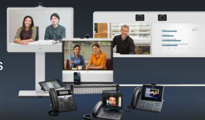
Cisco Business Edition 7000 for Enterprise