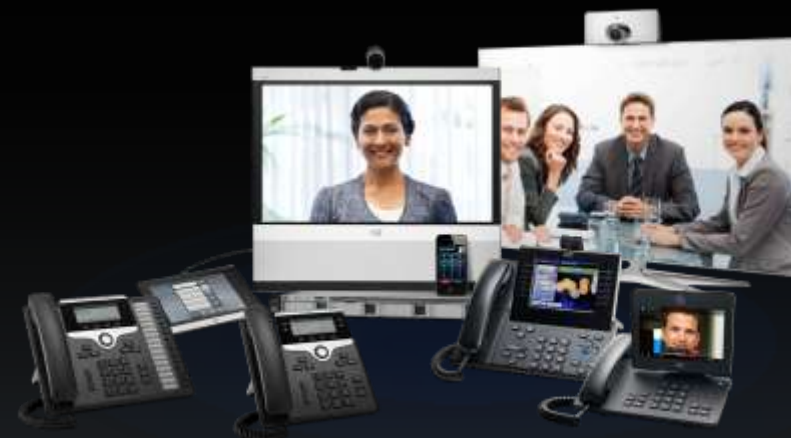
Cisco Business Edition 6000 for Midmarket