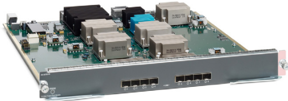
Figure 1. Cisco MDS 9000 10-Gbps 8-Port FCoE Module

Delivering full line-rate 10-Gbps speed across all ports, the Cisco MDS 9000 10-Gbps 8-Port FCoE Module provides connectivity for Cisco Nexus 5000 and Cisco Nexus 7000 FCoE traffic to traditional Fibre Channel SANs. Customers can leverage one operating system (NX-OS) and one management tool (DCNM-SAN), for both converged networks and traditional Fibre Channel SANs. In doing so, customers can extend the intelligent fabric services of Fibre Channel over IP (FCIP).