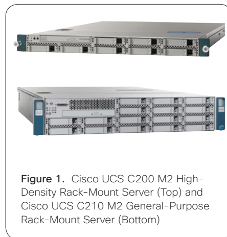
Figure 1. Cisco UCS C200 M2 High-Density Rack-Mount Server (Top) and Cisco UCS C210 M2 General-Purpose Rack-Mount Server (Bottom)

Cisco UCS C-Series Rack-Mount Servers deliver world-record-setting performance in an industry-standard form factor to reduce TCO, increase agility, and increase customer choice. Cisco UCS C-Series servers address a range of workloads through a balance of processing, memory, I/O, and internal storage resources. Cisco has tested and certified two popular server configurations for CDH to provide