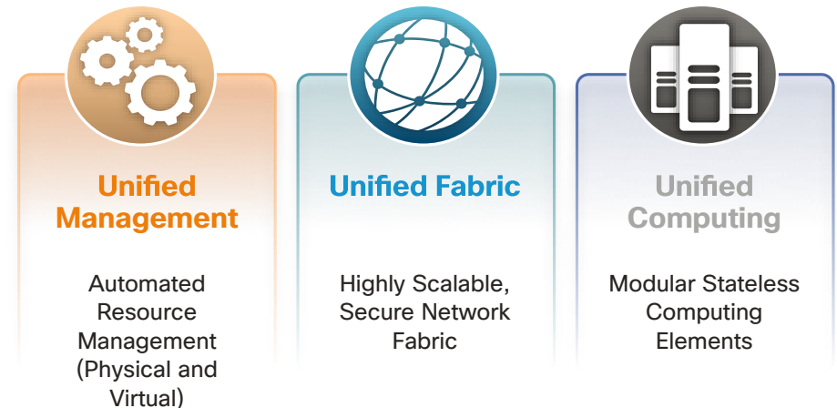
Figure 1. Cisco Unified Data Center: The Platform for Delivering IT as a Service