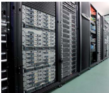
Cisco UCS offers much greater equipment utilization