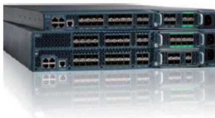
The UCS Fabric Interconnect links up not only the individual UCS system components, but also the UCS with the network and storage core systems in the data center

The Cisco Nexus 5000 Series Switch was the first Ethernet switch on the market to be able to handle FCoE. In the near future, this capability will also apply to the Cisco Nexus 7000 Series Switch core models, via a straightforward firmware upgrade. But what does this all mean in practical terms for the inner workings of a data center? "Firstly, Unified Fabric nearly always means a radical input/output consolidation on the server rack," says Dousse. "Where we previously needed 80 cables, we now only need eight: a reduction by the factor of ten. This not only cuts down the investment required, it also simplifies scalability. Installation and maintenance work are also substantially reduced."