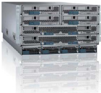
The UCS chassis: small, compact, space-saving