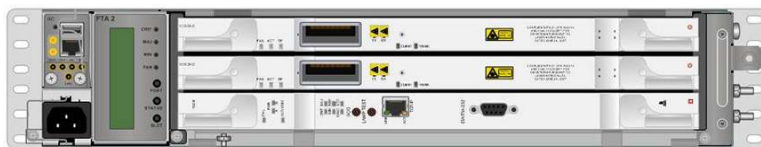
Figure 3. OTU-4 Regeneration Configuration in a Cisco NCS 2002 Chassis

You can enable an IPoDWDM configuration in the regeneration configuration to support proactive protection messaging between IPoDWDM router interfaces. If failure occurs on one side, ODUk Alarm Indication Signal (ODUk-AIS) is generated and propagated on the other side while an OTUk Backwards Defect Indicator (OTUk-BDI) is sent back on the same side as defined by the ITU G.709 standard.