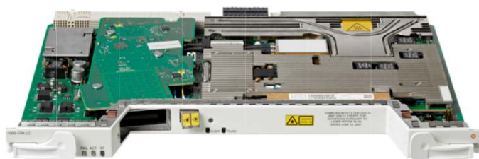
Figure 1. Cisco NCS 2000 100-Gbps Coherent DWDM Trunk Card with CPAK Client Interface

Continuing Cisco's innovation in 100 Gigabit technology, Cisco nLight silicon now extends to the client-facing interface through the Cisco CPAK pluggable transceiver. The extremely compact dimensions and low power consumption of CPAK enable a single-slot 100 Gigabit Ethernet coherent DWDM line card with a standards-based 100GBASE-LR4 client interface, resulting in a superb system density of one 100 Gigabit Ethernet transponder per rack unit.