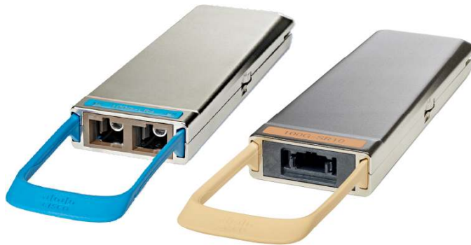
Figure 2. Cisco CPAK 100GBASE-LR4 Module (left) 100GBASE-SR10 Module (right)

The card features a software-configurable baud rate between 27.952 and 31.241 Gbaud depending on Forward Error Correction (FEC) selection, as well as a G.709v3 OTU-4 wrapped, ITU-compliant, 50-GHz spaced optical interface using LC connectors. The DWDM output line interface is tunable to 96 wavelengths across the full optical C-band. When operated within the outlined specifications, the trunk card can operate with a post-FEC bit error rate (BER) of better than 10E-15.