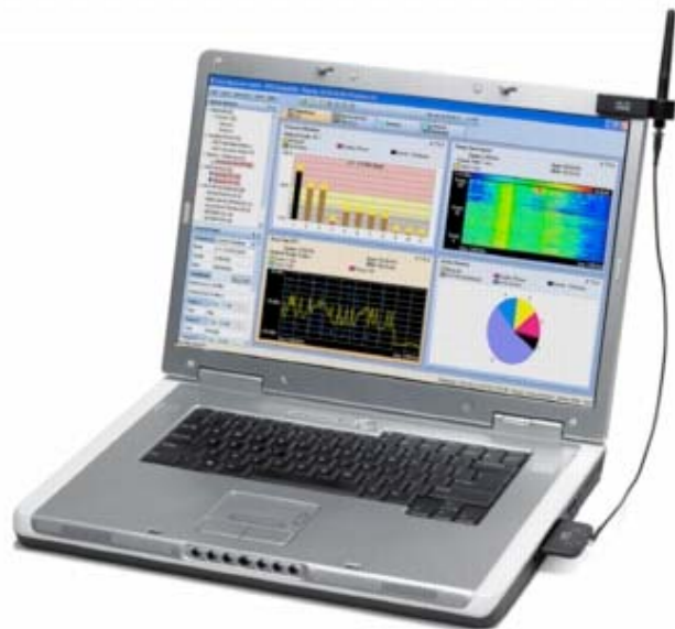
Figure 1 - Cisco's Spectrum Expert is the first spectrum analysis product designed for WLAN applications.

Fortunately, progress in VLSI, spectrum analyzer architecture, and associated software has resulted in a new class of WLAN assurance capability – what are known as Spectral Assurance (SA) tools, essentially spectrum analyzers designed for WLAN applications. These products combine spectrum analysis with the ability to determine if interference is causing a problem on the WLAN, identify and fingerprint specific interfering devices, and locate those devices. The first of these is Spectrum Expert™ from Cisco [ http://www.cisco.com/en/US/products/ps9393/index.html ], which can be seen in Figure 1. This is a simple yet very powerful PC Card-based product, frequently used with a clip-on external antenna, and based on a