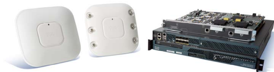
Figure 3 - The Cisco CleanAir product family includes the Aironet 3500i Access Point, Cisco 3500e Access Point, 5500 Series Wireless Controller, Catalyst 6500 Series Wireless Services Module (WiSM), and Mobility Services Engine (MSE). Source: Cisco Systems.

reduction in a wide variety of related opportunity costs - including lost productivity, regulatory violations, and customer-facing failures - that could have very severe impacts indeed on the entire enterprise. The addition of Cisco's Mobility Services Engine (MSE) (see Figure 3, which also illustrates all members of the CleanAir product family) adds automated location of interferers, and a pervasive deployment of 3500s enables automatic remediation of spectrally-related challenges. We expect infrastructure-based spectral assurance to be one of the most important trends in wireless LANs over the next few years - the benefits (including the potential for much lower operational expense as discussed in this White Paper) are clear, and the challenges arising from not having this capability potentially quite damaging to many aspects of an enterprise's operations.