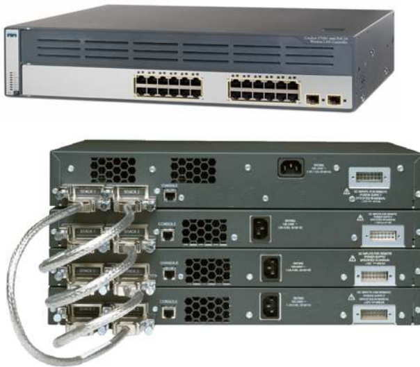
Figure 2. Unified Wireless LAN with the Cisco Catalyst 3750G Integrated Wireless LAN Controller