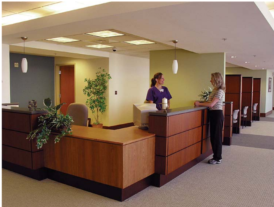
Figure 1. Women's Imaging Check-in Area

At SAMC, physicians and nurses use Wi-Fi devices (Fujitsu tablets, IBM and Dell laptops) that allow them secure access to clinical information at patient bedside, in operating rooms and in ancillary areas. With the Cisco secure wireless solution, clinicians benefit from WLAN technologies to increase their productivity while keeping patient data private and secure, helping SAMC meet the rigorous regulatory compliance demands.