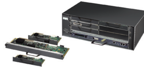
Figure 2. Cisco 7200 VXR Router

More security services run concurrently with data, voice, and video routing, enabling organizations to apply consistent and comprehensive security services throughout their networks and build self-defending networks.