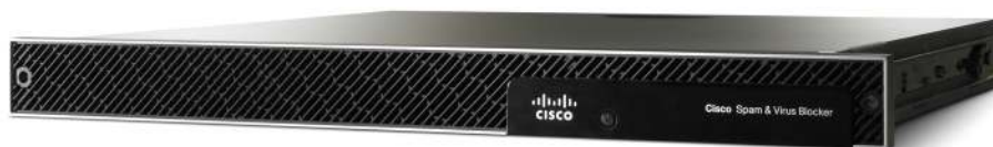
Figure 1. Cisco Spam & Virus Blocker