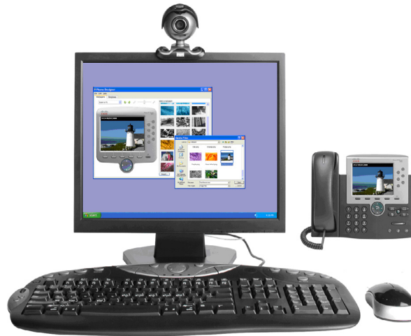
Figure 1. Customize Cisco Unified IP Phone Color Display with Phone Designer

As businesses and organizations move toward open office environments to promote teamwork between co-workers, having a unique ring tone on your Cisco Unified IP Phone can help you quickly determine when someone is trying to call your desk phone. Whether you are walking back to your cubical from a meeting or white boarding in a neighbor's cubical, you need to react only to business calls directed to your phone distinguished by your personalized ring tone.