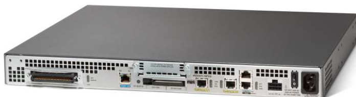
Figure 1. The Cisco IAD2430 Series Devices

The Cisco IAD2430 builds on the Cisco IAD2420's patented Simple Network-enabled Auto Provisioning (SNAP) technology, a next-generation auto-installation mechanism designed for faster service turn-up, configuration, and remote updates. When used with Cisco Configuration Express, service providers can order, preconfigure, and ship the Cisco IAD2430 directly to end customers, reducing the costs of warehousing, shipping, and manual intervention.