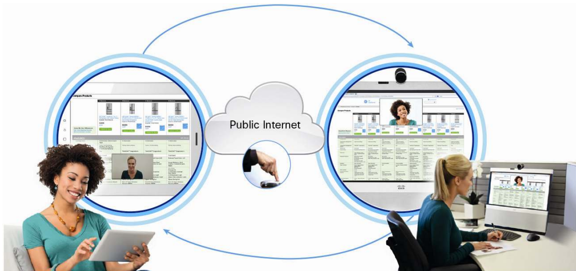
Figure 1. Jabber Guest Reinvents Consumer-to-Business Collaboration

Figure 1 shows you how Jabber Guest looks to your customer.