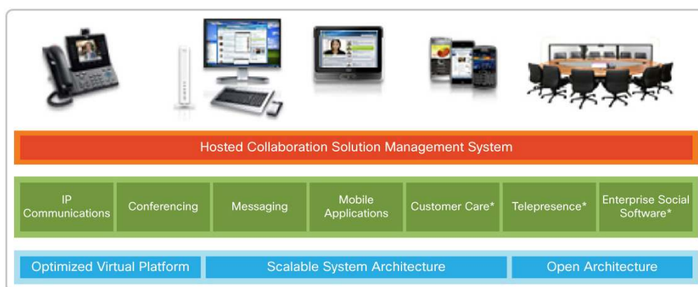
Figure 1. Cisco Hosted Collaboration Solution

Customers are adopting Cisco HCS because it allows them to gain all the functions of a Cisco Unified Communications Manager environment with an effective pay-per-use service that the cloud can provide. For many, this means they can enjoy the benefits of the rich collaboration feature set and broad set of endpoint choices that are often missing in a traditional IP Centrex environment. Overall, the service is a win for both partners that can offer this new and effective cloud-based service and enterprise customers who can take advantage of the cloud without a compromise on reliability (Figure 1).