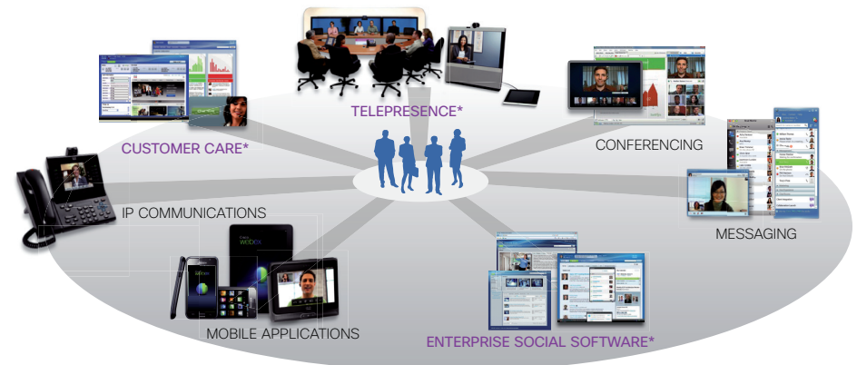
Figure 1. HCS Collaboration Applications and Capabilities