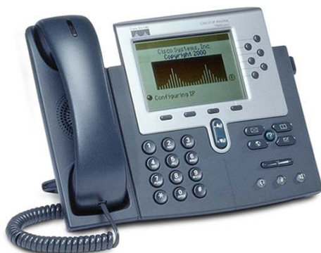
Figure 1. Cisco Unified IP Phone 7960G

The Cisco Unified IP Phone 7960G, a key offering in the IP Phone portfolio, is a full-featured IP phone primarily for manager and executive needs. It provides six programmable line/feature buttons and four interactive soft keys that guide a user through call features and functions. Audio controls for duplex speakerphone, handset and headset. The Cisco Unified IP Phone 7960G also features a large, pixel-based LCD display. The display provides features such as date and time, calling party name, calling party number, and digits dialed. The graphic capability of the display allows for the inclusion of such features as XML (Extensible Markup Language) and future features.