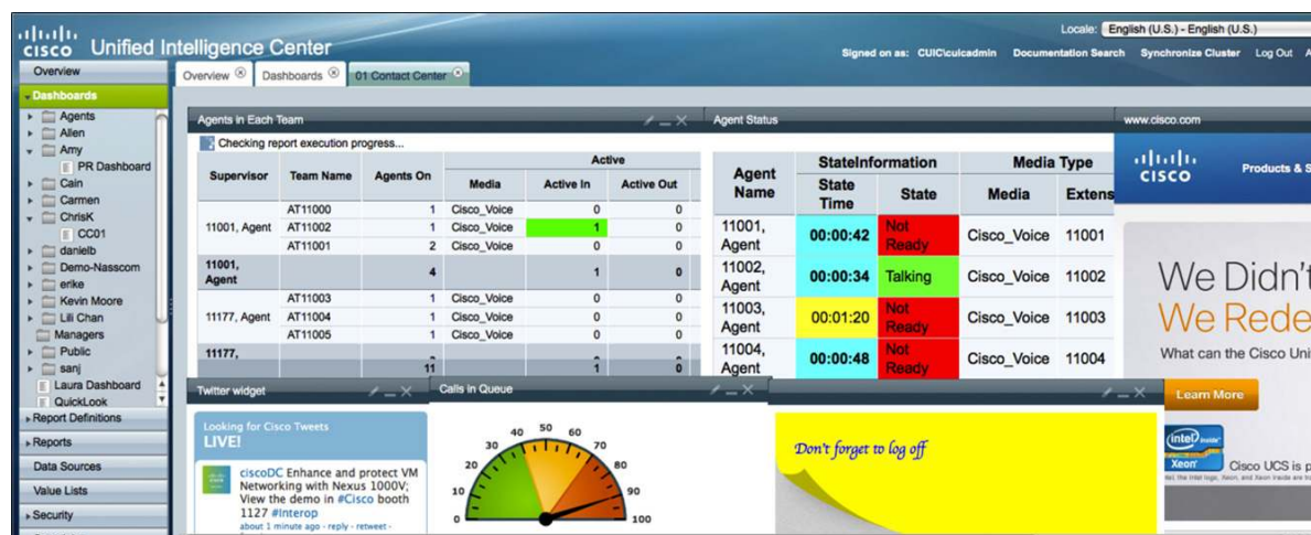
Figure 1. Cisco Unified Intelligence Center Dashboard

Cisco Unified Intelligence Center allows customers to extend the boundaries of traditional contact center reporting to an information portal where data can be easily integrated and shared throughout the organization.