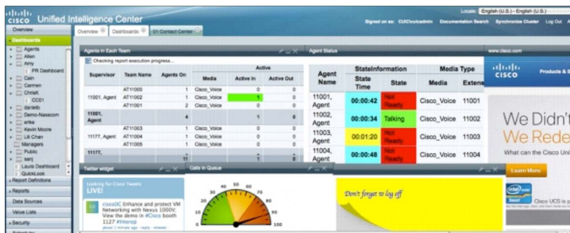
Figure 1. Cisco Unified Intelligence Center Dashboard

Cisco Unified Intelligence Center allows customers to extend the boundaries of traditional contact center reporting to an information portal where data can be easily integrated and shared throughout the organization.