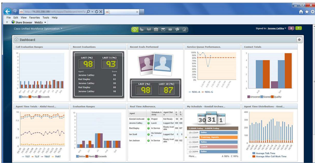
Figure 1. Cisco Unified Workforce Optimization Personalized Performance Dashboard

To help companies provide efficient, effective, customer-focused service in the contact center, supervisors must have the tools they need to manage team performance. Cisco Unified Workforce Optimization transforms the supervisor experience, giving supervisors access to more data and more powerful tools in simplified and flexible views so they are better equipped to lead their teams in delivering exceptional customer experiences (Figure 1).