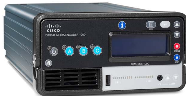
Figure 1. Cisco Digital Media Encoder 1000

The Cisco Digital Media Encoder 1000 provides several different audio and digital media connections as well as both 1-GB and 10-/100-Mb Ethernet connections. In addition, a front-panel dock is available to connect and download directly to an Apple iPod.