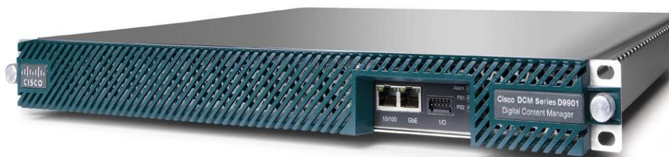
Figure 1. Cisco DCM Series D9901 Digital Content Manager – IP Video Gateway

The DCM Series D9901 IP Video Gateway provides simultaneous transport of uncompressed standard-definition (SD), high-definition (HD), and 3G high definition (3G-HD) SDI video, as well as compressed video using JPEG2000. At the transmitter site, the DCM IP Video Gateway enables SDI video to be carried over 1 Gigabit Ethernet or 10 Gigabit Ethernet. At the receiving site, the DCM IP Video Gateway converts the IP-encapsulated stream back to a baseband SDI video signal.