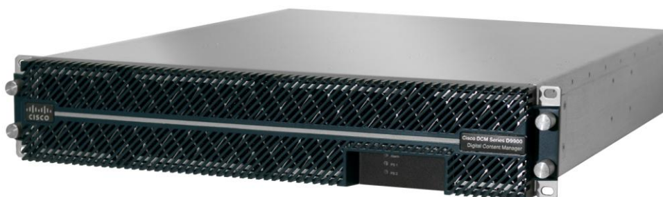
Figure 1. Cisco DCM Series D9900 MPEG Processor

Today's digital systems demand powerful, flexible, and compact solutions that allow the service provider to support new network architectures. The Cisco® DCM Series D9900 Digital Content Manager (DCM) MPEG Processor is a compact 2RU platform capable of processing a high number of MPEG video streams. The DCM Series D9900 MPEG Processor is the next generation of intelligent headend processing equipment where the combination of compactness and flexibility leads to a cost-effective solution. Based on our experience, the DCM Series D9900 MPEG Processor brings operational and economic benefits in MPEG processing applications. The optional built-in DVB scrambler allows easy integration with several Conditional Access (CA) systems.