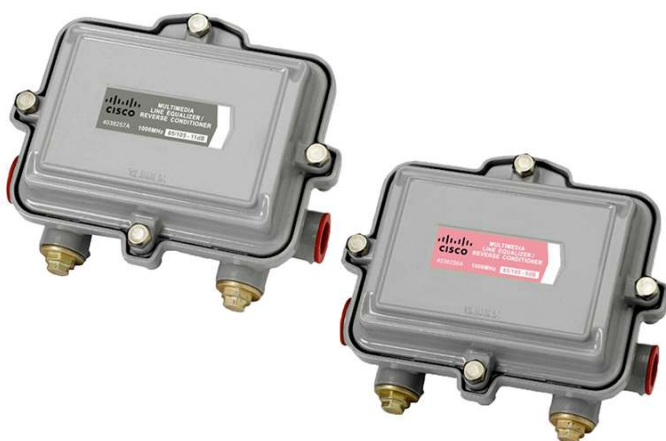
Figure 1. Cisco Multimedia Line Equalizer/Reverse Conditioner

With greater percentages of devices, such as high-speed data and telephony modems, transmitting in the upper end of their RF transmit ranges, improvements in carrier-to-ingress and carrier-to-noise performance can be realized.