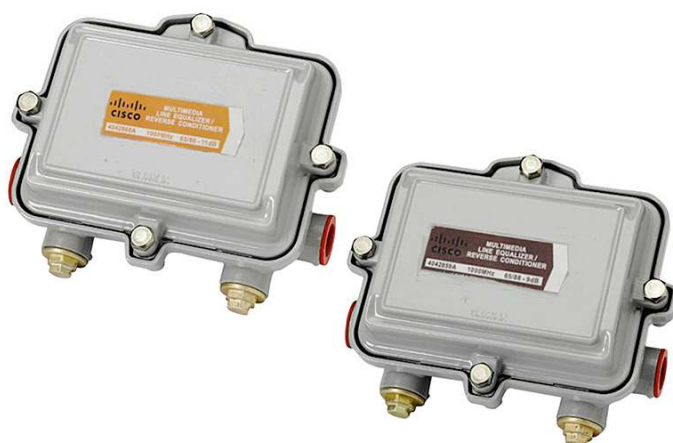
Figure 1. Cisco Multimedia Line Equalizer/Reverse Conditioner

With greater percentages of devices, such as high-speed data and telephony modems, transmitting in the upper end of their RF transmit ranges, improvements in carrier-to-ingress and carrier-to-noise performance can be realized.