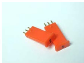
Pads (Attenuators), 77140