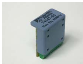
Reverse Equalizers, 74141