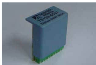
Plug-in Diplex Filters, 75130