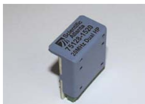
Ingress Blocking Filters, 75127/75128 Nodes Only