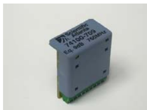
Forward Equalizers, 74100