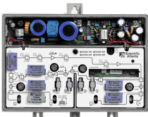
Figure 1. Cisco Compact EGC Amplifier Model 93250-93251

The amplifier (Figure 1) performs to 1 GHz in the forward path, and it can be configured electronically, using a handheld programmer terminal, for rapid initial setup or for adjustments that are needed as network requirements shift. All settings can be done without interrupting service, an especially important capability in networks that deliver voice over IP (VoIP) services. Settings for this EGC amplifier can be established or modified using a handheld programmer terminal. To streamline configuration, settings from one amplifier can be uploaded to the handheld programmer terminal for downloading to other amplifiers. Different forward-gain settings can be obtained in the amplifier, allowing it to support several different applications within the network, so a single amplifier model can help reduce inventory and costs.