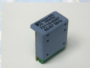
Diplex Filters 75110 Amplifiers Only