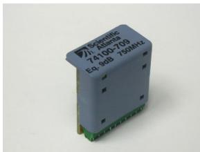
Forward Equalizers 74100