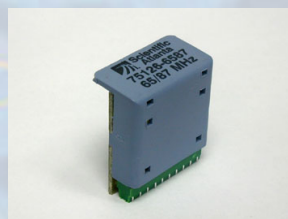
Diplex Filters 75126 Nodes Only