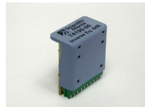
Inverse Equalizers 74190