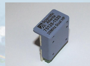
Ingress Blocking Filter 75127/75128 Nodes Only