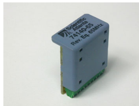
Reverse Equalizers 74140