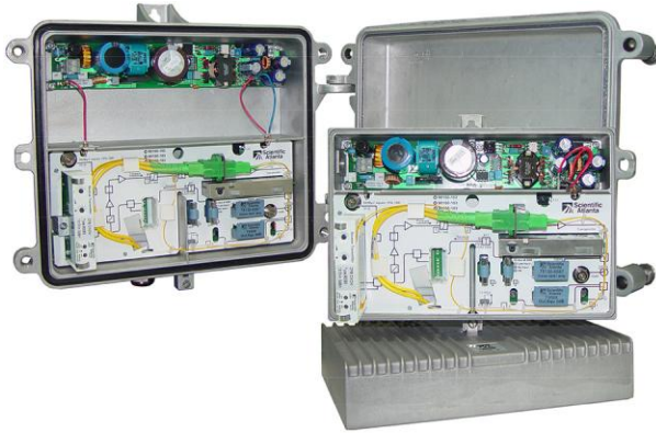
Figure 1. Cisco Compact EGC Fiber Deep Nodes A90100 and A90300