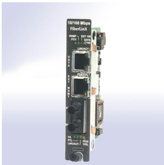
Figure 1. Prisma FiberLinX-II Optical Media Converter Module

Prisma FiberLinX modules allow for remote configuration, and alert administrators to any potential problems on the long-haul fiber run. These modules also provide vital information on link condition and report data traffic statistics. Additionally, these modules help reduce the total cost of network equipment by functioning as a copper-to-fiber media converter, allowing the use of lower-cost copper switches at both ends of the fiber connection.