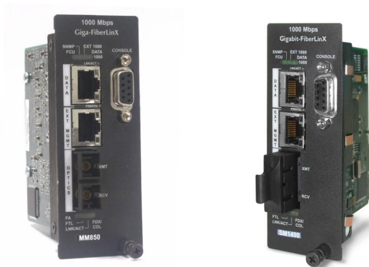
Figure 1. 1310/1550 nm Gigabit FiberLinX-II Module (Left) and CWDM Gigabit FiberLinX-II Module (Right)

Prisma FiberLinX modules allow for remote configuration, and alert administrators to any potential problems on the long-haul fiber run. These modules also provide vital information on link condition and report data traffic statistics. Additionally, these modules help reduce the total cost of network equipment by functioning as a copper-to-fiber media converter, allowing the use of lower-cost copper switches at both ends of the fiber connection.