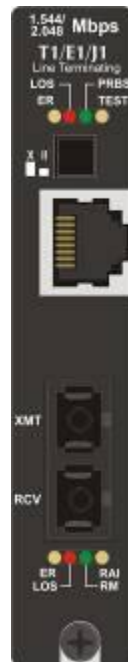
Figure 1. T1/E1/J1-LineTerm Module

As an SNMP management application, PrismaView gives network managers the ability to monitor and control IMC Networks products. PrismaView runs standalone on Windows NT/XP/2000, as a standalone Java Application for other operating systems, in conjunction with HP OpenView, as a Web Server running under IIS, or as a Java Web Servlet.