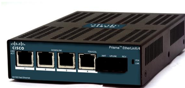
Figure 1. Prisma EtherLinX/4 Module

Featuring SNMP management, 802.1Q VLAN, multi-queue QoS, traffic prioritization, bandwidth control, and multicast pruning/snooping (using IGMP v1, v2), EtherLinX/4 is perfect for a wide range of Fiber-to-the-Home, Fiber-to-the-Curb, and Fiber-to-the-Business (collectively "FTTx") services, and is an ideal solution for delivering those Ethernet-based services to customers quickly and cost-effectively. EtherLinX/4 also features Telnet and serial configuration, and remote firmware upgrading via a TFTP server or PrismaView SNMP management application software. Designed with a small footprint, EtherLinX/4 facilitates easy installation inside the premises.