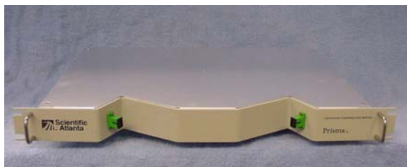
Figure 1. Dispersion Compensation Module

Prisma Dispersion Compensation Modules are designed for single 19-inch 1RU rack mount configurations and are available in a variety of set-ups to accommodate different system needs.