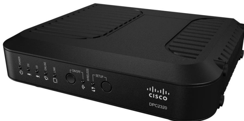
Figure 1. Cisco Model DPC2320 DOCSIS 2.0 Wireless Residential Gateway (image may vary from actual product and specification)

Designed for the active digital home or office, the DPC2320 integrated router features a Dynamic Host Configuration Protocol (DHCP) server, Network Address and Port Translation (NAT/NAPT), and a Stateful Packet Inspection (SPI) firewall. These features allow the user to share a single high-speed public Internet connection as well as share files and folders between devices within the home network by attaching multiple wired and wireless devices in the user's home or office to the wireless residential gateway.