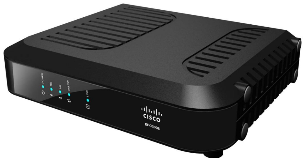
Figure 1. EPC3008 EuroDOCSIS 3.0 8x4 Cable Modem (image may vary from actual product and specification)

The EPC3008 is designed to meet EuroDOCSIS 3.0 specifications as well as being backward compatible with EuroDOCSIS 2.0, 1.1, and 1.0 networks.