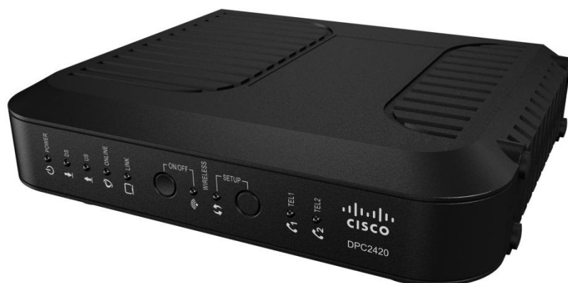
Figure 1. Cisco Model DPC2420R2 DOCSIS 2.0 Wireless Residential Gateway with Embedded Digital Voice Adapter (image may vary from actual product and specification)

Designed for the active digital home or office, the DPC2420R2 integrated router features a Dynamic Host Configuration Protocol (DHCP) server, Network Address and Port Translation (NAT/NAPT), and a Stateful Packet Inspection (SPI) firewall. These features allow the user to share a single high-speed public Internet connection as well as share files and folders between devices within the home network by attaching multiple wired and wireless devices in the user's home or office to the wireless residential gateway.