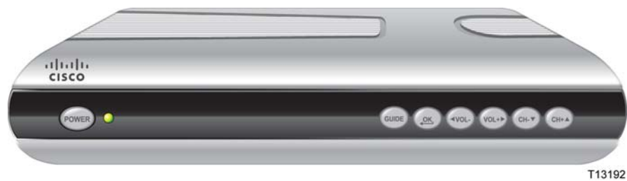
Figure 1. Cisco Z60DVB Set-Top

The Z60DVB set-top is optimized for an affordable cost and offers a focused range of available features such as an expanded memory, a full-featured front panel, and a SIM card reader. The set-top is DVB®-C and MPEG-2 compliant and supports PAL video formats. With the SIM card reader, the Z60DVB set-top is also capable of supporting renewable security.