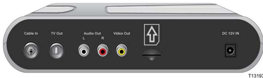
Table 2. Back Panel Features