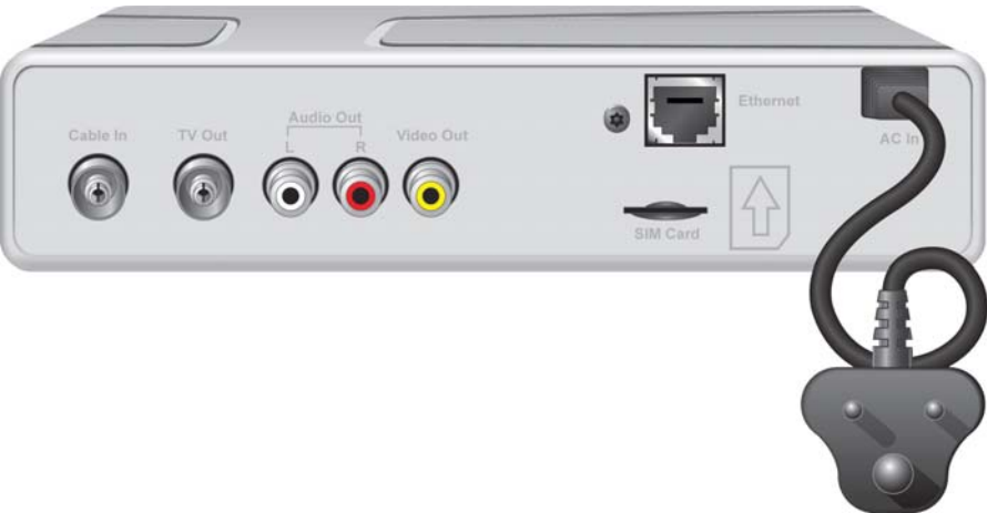
Table 2. Back Panel Features