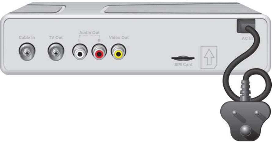
Figure 4. Cisco Z270DVB Back Panel (image may vary from actual product and specification)