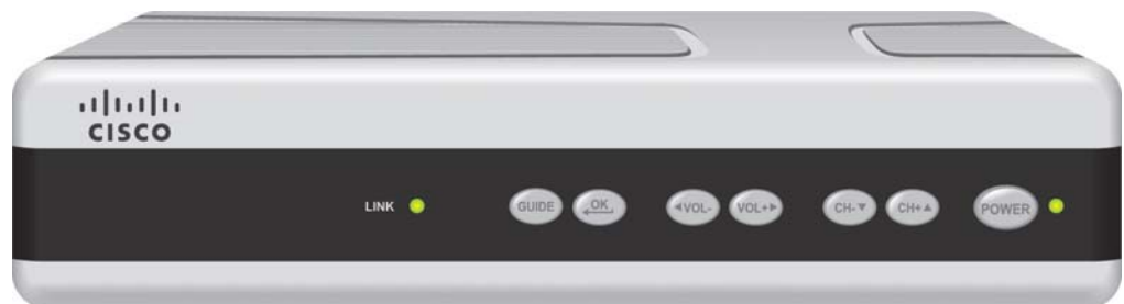
Figure 1. Cisco Z260DVB and Cisco Z270DVB Digital Broadcast Set-Top (Cisco Z270DVB model shown) (image may vary from actual product and specification)

Both set-top models are DVB-C and MPEG-2 compliant, support PAL video formats, and include an optional SIM card reader that is capable of supporting renewable security.