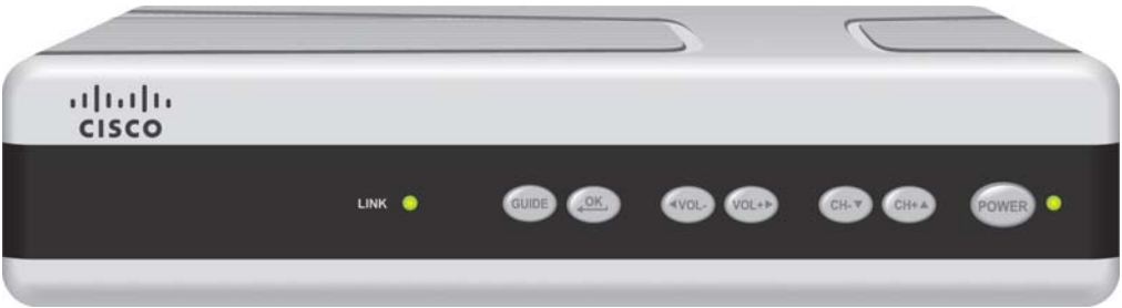
Table 1. Front Panel Features