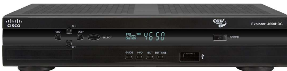
Table 1. Front Panel