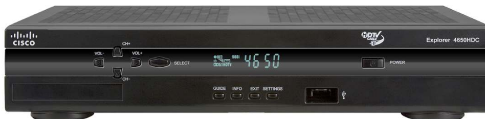
Figure 1. Cisco Explorer 4650HDC Front Panel (Image May Vary from Actual Product and Specification)

The 4640HDC and 4650HDC set-tops support the tru2way™ (formerly OCAP™) and Federal Communications Commission (FCC) mandates for separable security. The set-tops also offer MPEG-4 (H.264) high definition (HD) and standard definition (SD) decoding with HD and SD outputs and DOCSIS® 2.0 data capability. The 4650HDC set-top also provides analog tuning.