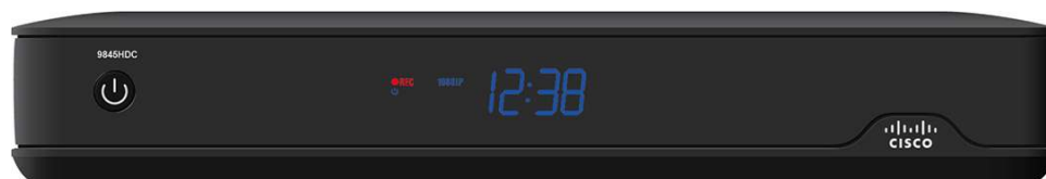
Figure 1. Cisco Explorer 9845 Video Gateway Front Panel (image may vary from actual product and specification)