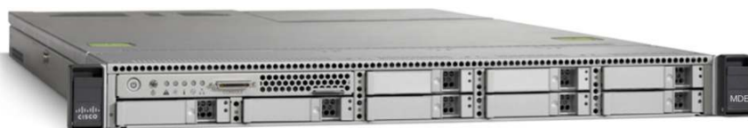
Figure 1. Cisco MDE Platform