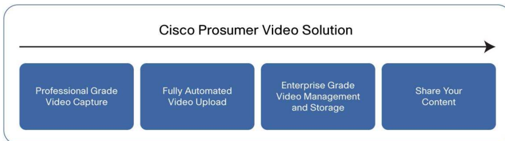
Figure 1. Cisco Prosumer Video Enables Video-Based Collaboration Anywhere, Anytime

You do not need to install any software on your computer to use the Cisco Online Video Workspace cloud service, and your company does not have to make any investment in servers, firewalls, storage, or network bandwidth. Instead, you simply visit the website and enter your account information to log on (Figure 2). After you are authorized, you can: