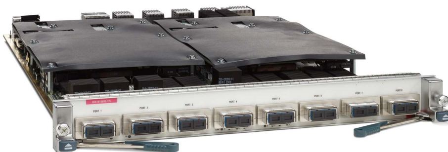
Figure 2. Cisco Nexus 7000 Series 8-Port 10 Gigabit Ethernet Module with XL Option

The Cisco Nexus 7000 8-Port 10 Gigabit Ethernet Module with XL Option (Figure 2) is a cost-effective, highly scalable module designed for performance-driven, mission-critical Ethernet networks. The module uses two M1-XL forwarding engines, providing a throughput of up to 120 million packets per seconds (Mpps), eight nonoversubscribed 10 Gigabit Ethernet ports and a larger forwarding information base (FIB) table, making it ideal for deployment at an Internet Exchange Point (IXP), a service provider, or a large enterprise. The module supports a broad range of X2 optics, allowing deployment in various types of situations, from long-reach intersite over single-mode fiber to short and medium reaches over multimode fiber for data center and campus environments. The 8-port 10 Gigabit Ethernet module is supported by both the 18-slot and the 10-slot chassis (Cisco NX-OS 5.0 and later).