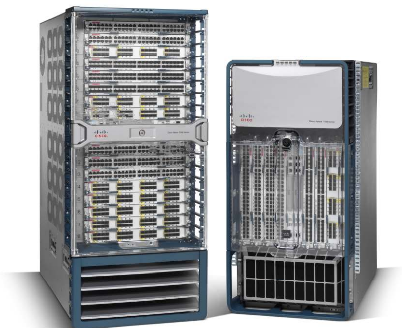
Figure 1. Cisco Nexus 7000 Series

The Cisco Nexus 7000 Series (Figure 1) provides integrated resilience combined with features optimized specifically for the data center for availability, reliability, scalability, and ease of management.