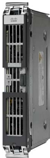
Figure 1. Cisco Nexus 7700 6-Slot Fabric-2 Module

The Cisco Nexus 7700 Fabric-2 modules (Figures 1, 2 and 3) for the Cisco Nexus 7700 Series switches are separate fabric modules that provide parallel fabric channels to each I/O and supervisor module slot. Up to six simultaneously active fabric modules work together, delivering up to 1.32 Tbps per slot. Through the parallel forwarding architecture, a system capacity of more than 42 Tbps is achieved with the six fabric modules. The fabric module provides the central switching element for fully distributed forwarding on the I/O modules.